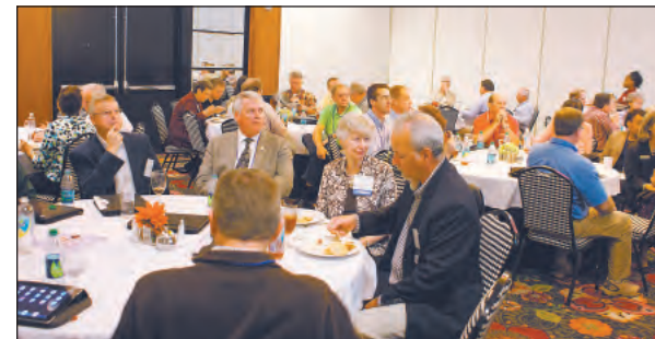
NCATC Conference crowd prepares for one of the keynote speakers.