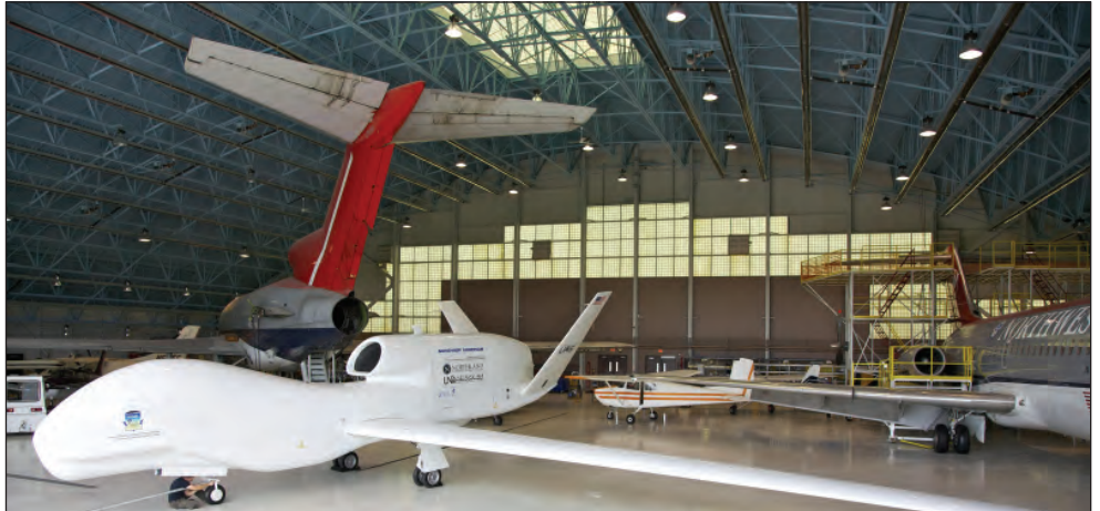
Pictured above, the Northland Community & Technical College aviation campus hangar in Thief River Falls, MN. In the forefront, a full-scale model of the Global Hawk unmanned aircraft, donated to the college foundation by Northrop Grumman.